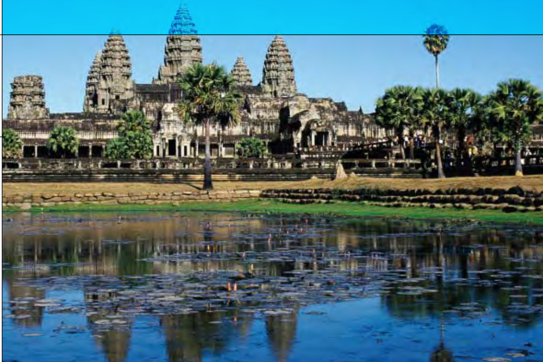
Angkor Wat, meaning “City Temple,” was built in the 12th century.

Bring the Far East closer with this tour of Southeast Asia that showcases the gorgeous extremes of Thailand, Cambodia and Vietnam. Bangkok’s skyscrapers balance the quiet beauty of Angkor Wat, and the opulent Grand Palace contrasts a Mon tribal village. Ride an elephant, meander through the Cai Rang floating market, walk through history in Ho Chi Minh City and realize the breadth of this one-of-a-kind adventure.