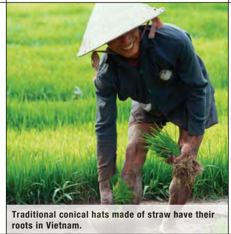
Traditional conical hats made of straw have their roots in Vietnam.

evening introduces you to mystical dances, authentic cuisine and true Thai ambience. During dinner, feast your eyes on the grace and beauty of the dancers, who elegantly perform stories from classical Thai literature and folktales.