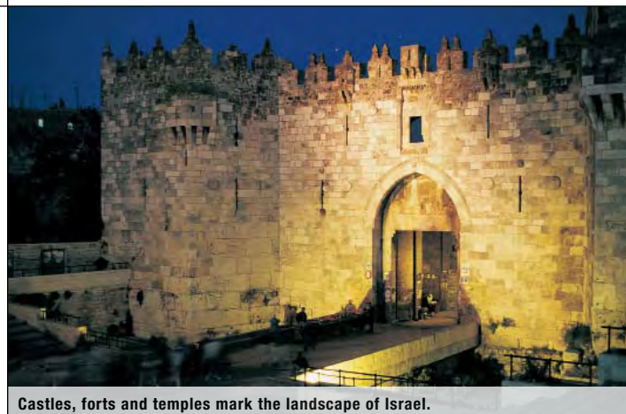
Castles, forts and temples mark the landscape of Israel.